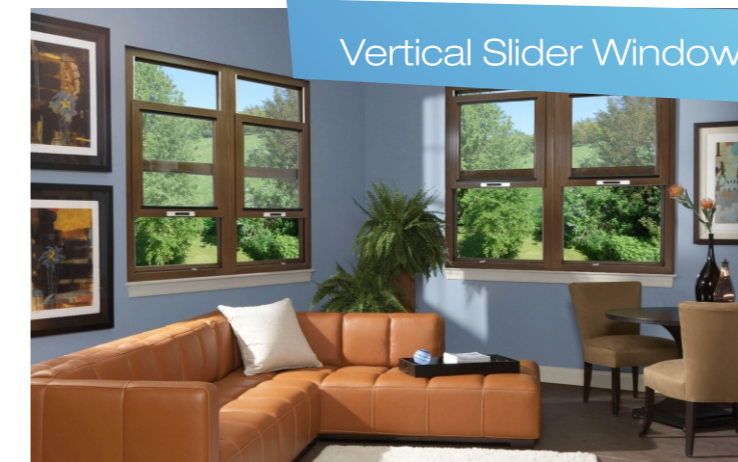
Vertical Slider Windows

ENCRRAFT Vertical Slider Windows, a traditional fenestration concept that has become the perfect solution for ancillary frames when the opening aperture is taller than width i.e. reference golden ratio 1:1.618, and when one opening sash is required for ventilation and/or fire escape! Its simple operation is based on a pair of frame specific, site tensioned, spiral balances that can hold the sash open in any position. The spiral balance technology has successfully replaced the traditional weights and pulleys method because of requiring less space enabling the modern uPVC vertical slider to fit perfectly into both aperture types, straight through or reveal.