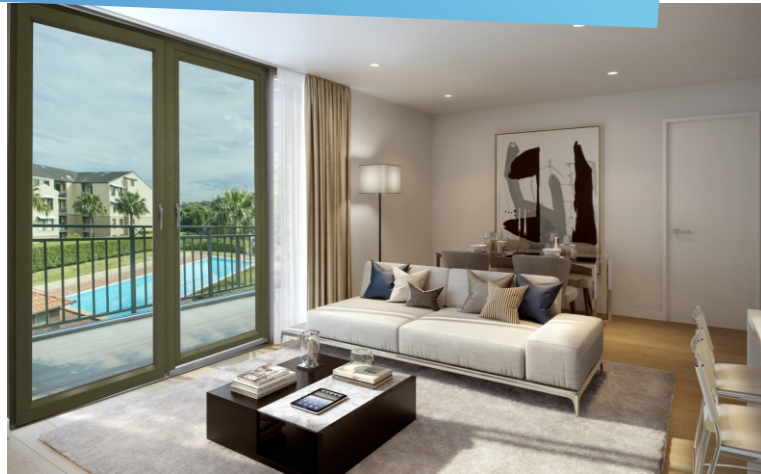
Heavy Duty Patio Doors

Modern frame apertures are getting bigger and the demand for more glass and less vertical divisions by frame members is also increasing. ENCRAFT's Heavy Duty Patio Doors can comply with those new challenges with its 2-pane version which can be manufactured up to 5.8 mtrs wide and up to 3.0 mtrs tall, accepting a maximum sash weight of 300 kg. The overall outer frame depth of 142 mm housing two 62 mm deep sashes is perfectly suited for modern straight through apertures. The effortless operation of the heavy sash (es) is achieved by using tandem rollers with a high weight carrying capacity, ENCRAFT's solid Aluminium threshold construction and a good gripping D-handle, anchored into the concealed sash steel.