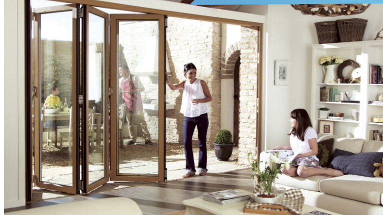
Fold N Slide Doors

ENCRAFT Fold N Slide Doors system provides superior operating performance and smooth integration into any architectural style and space. The door system is engineered using high quality uPVC Window and Door profiles and superior hinge and locking systems that are reliable and secure. The rollers along which the doors slide, offer a smooth glide and reliable performance with solid design and expert engineering.