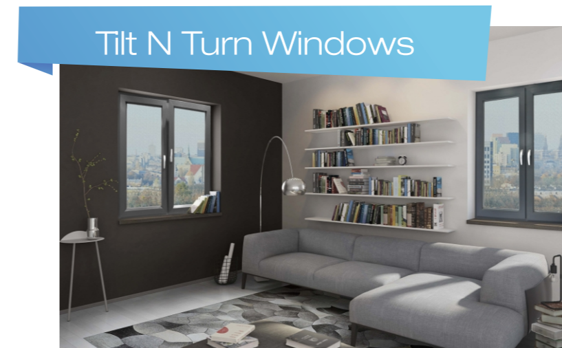
Tilt N Turn Windows

ENCRRAFT Sliding Window range are designed to provide the maximum flexibility for fabricators and clients alike. Based on a range of sections, it offers full flexibility offering from single sliding to multiple sliding openers, clip on or integrated sections for fly screen and a range of section sizes covering small and large openings. It provides the ideal range of products to suit any window replacement program or building type in the fast growing construction industry.